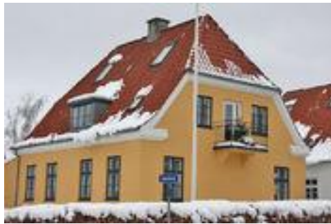
BB Strøbergvej Ålborg