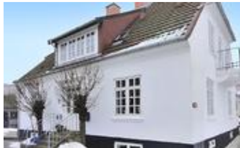
Anne Maries Vej BB

Prices per night: Single room DKK 300.00 and double room: DKK 400.00