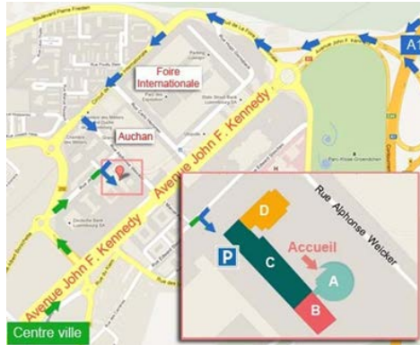
Fig. 2. Parking places in Weicker Building

You will need to take the lift to go up from the underground parking to the ground floor to the reception desk.