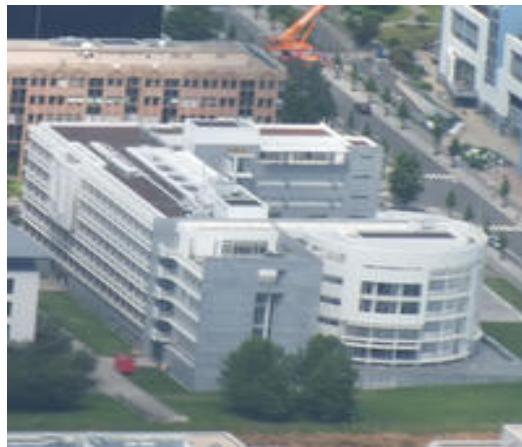
Fig. 1. Weicker Building where SnT is located

Room B001, Weicker Building (Ground Floor), Rue Alphonse Weicker, 4 L-2721, Kirchberg, Luxembourg